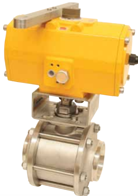
WAFV 80 WE