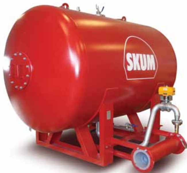
Prepiped bladder tank foam system Incl. WAFV